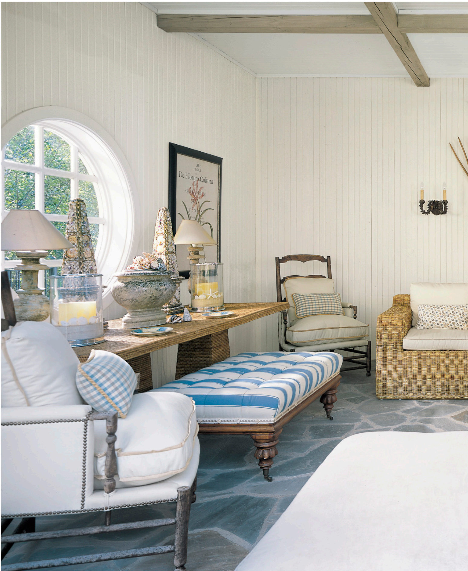
A pair of outdoor rooms face a